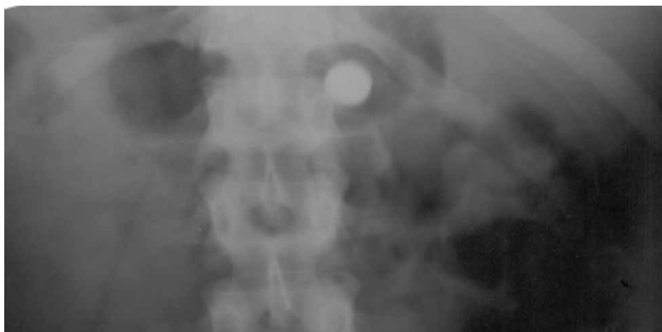
Fig. 2. X-ray radiogram of abdomen 6 h after ingestion of optimized placebo BFT formulation.

b Mean ± SD, n = 6 (floating and drug content studies), n = 10 (hardness test).